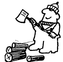
lift a finger

CATTLE 405. Compared with last Thursday's market, slaughter steers grading standard and good, 25-50 cents higher. Slaughter cows steady to $1.25 higher. Slaughter steers couple