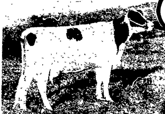
BROWNCROFT VERNON JOB IRIS (VG-87) Very Good Mammary 2y 317d 2X 16,258 3.8% 621 3y 306d 2X 25,743 3.9% 994