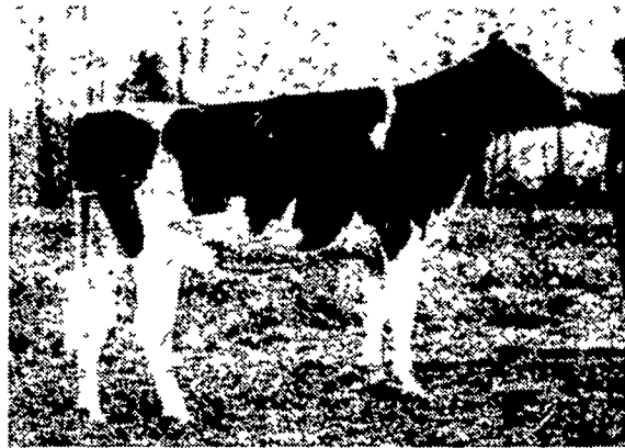
BROWNCROFT STANDOUT PAMULA (VG-87) Excellent Mammary 2y0m 333d 2X 18,171 4.2% 757 3y0m 296d 2X 24,186 4.1% 1002