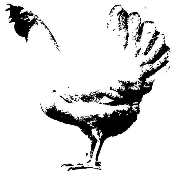
BABCOCK B-300V 1st CAGE AND FLOOR.

If you've been buying chicks based on Random Sample performance, isn't it time to buy today's winner -- the Babcock B-300V.