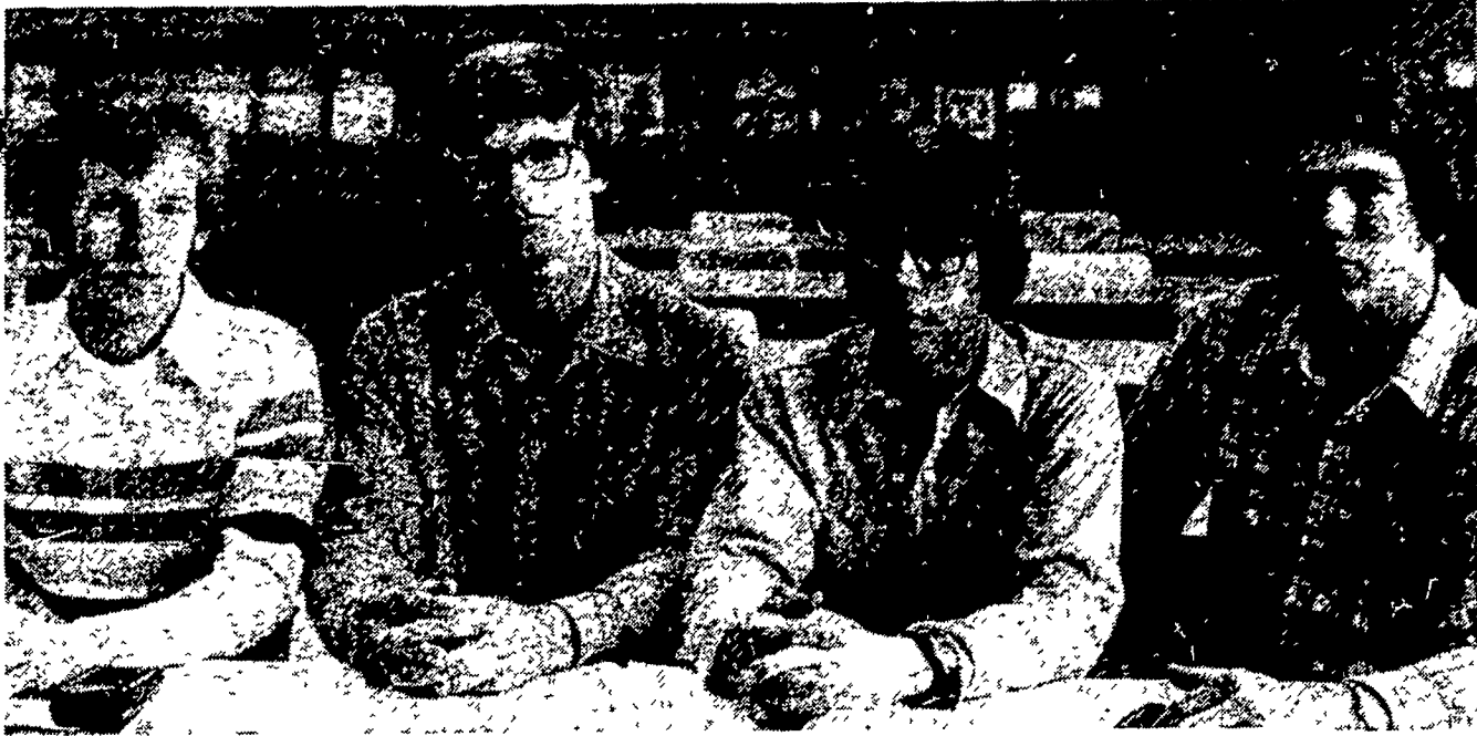
The Solanco Future Farmers of America chapter walked away with the four top county winners in the Lancaster County Farm Management Contest