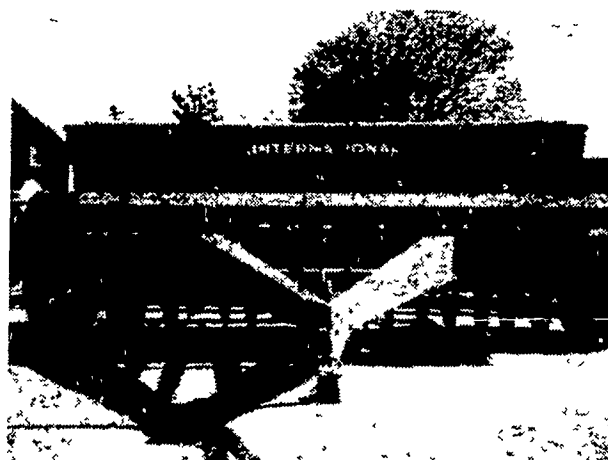
USED GRAIN DRILL

MF 720 Disk (28) 26" Blades w/Cylinder ..... $3,950.