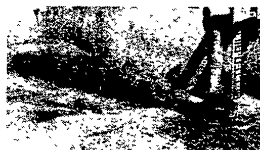
PIT CHOPPER PUMP