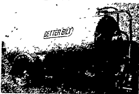
VACUUM SPREADERS Sizes Available:

800 gal. 1100 gal. 1500 gal. 2100 gal. 2600 gal. 3100 gal. 3600 gal. 4000 gal.