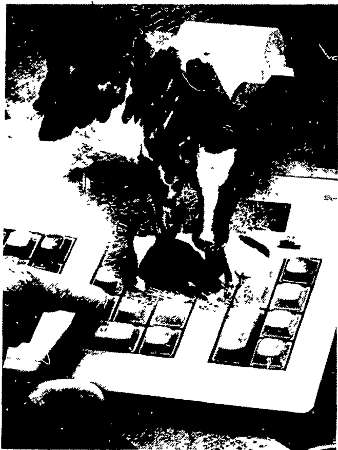
Figure it for yourself.

We welcome all farm equipment dealers business.