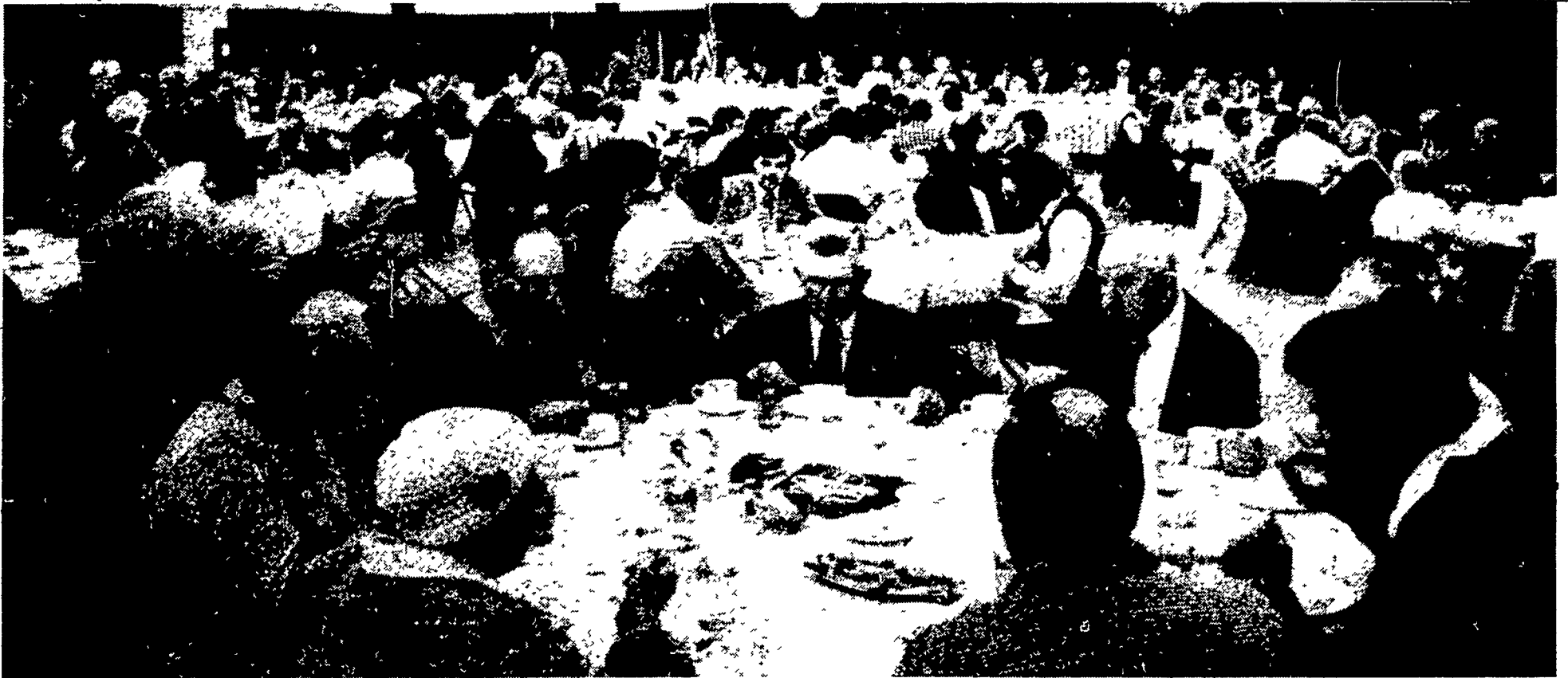
The slogan of Lehigh Cooperative Farmers -- "LeHi -- where it's happening!" -- held true this week when the 750-member group held its annual meeting in Allentown. Prior to the luncheon, the co-op's officers presented their annual reports which were accompanied with multi-projection slides of LeHi's operations and history. They received the approval and favor of the audience.