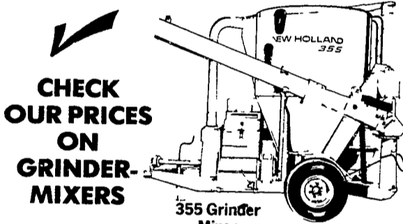
355 Grinder Mixer

SPREADERS BUILT EXTRA RUGGED TO WORK WHEN YOU'RE READY!