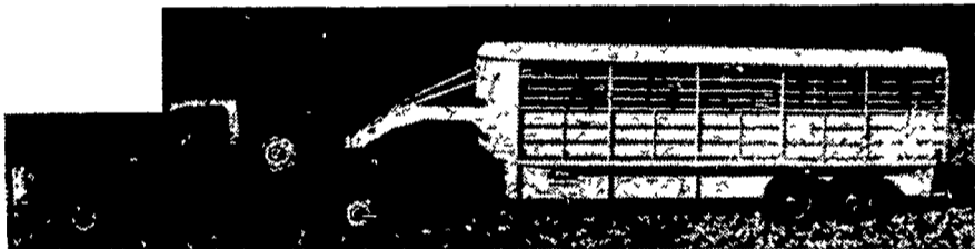
Standard Livestock Trailer as Shown is 20'x6' with Metal Top and Front.