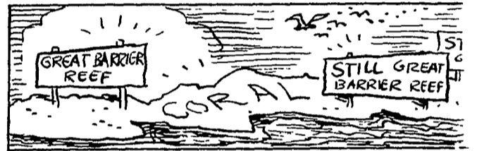
The largest coral reef in the world is the Great Barrier Reef near the northeast coast of Australia. It extends 1,250 miles.

Auctioneers: Ira Stoltzfus & Son Other local auctioneers.