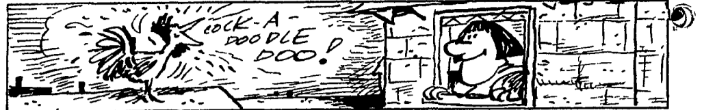
Some people believed that a rooster crowing during the day meant a friend would visit.