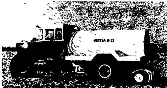
2000 gallon vacuum inductor tank with the three knife injection plow mounted on a Tryco Super T chassis.