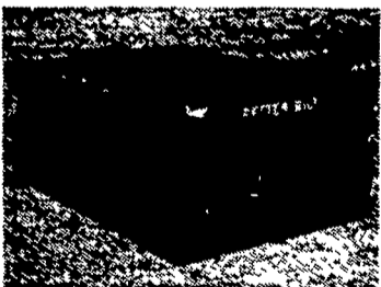
STOCK WATER TANK