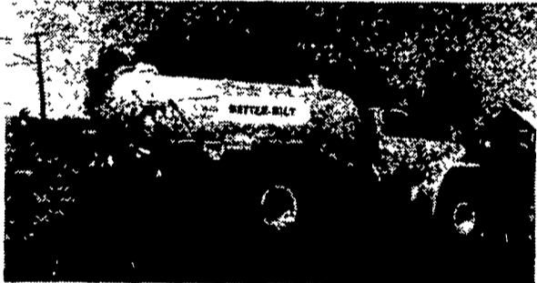
2000 gallon model tank with a full opening rear door mounted on a Field Gummy chassis.