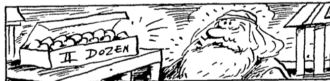
The ancient Greeks believed eating raven's eggs would restore blackness to gray hair.