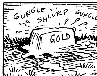
At one time it was thought gold dissolved in dew.

Thursday, Mar. 2, 1978 HOGS: 6000 - Barrows & gilts active, 50-75 higher. US 1-2 200-240 lb. 48.00- 48.50; US 1-3 200-250 lb. 47.75- 48.00. Sows: 50-1.00 higher. US 1- 3 300-450 lb. 41.50-42.50; 450- 500 lb. 43.00-43.50; Over 500 lb. 44.00-44.50.