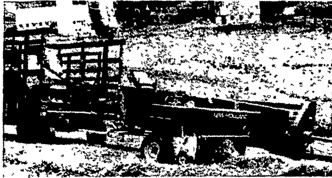
This new Hayliner from the Lancaster County Farm equipment manufacturer -- Sperry New Holland -- will throw bales weighing as much as 80 pounds.

The device eliminates the need for the operator to twist around in the tractor seat