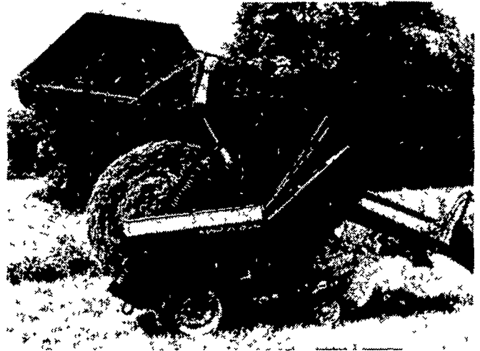
An automatic wrapping system on Sperry New Holland's new round balers can bale as many as 18 extra bales per day due to the time saved.

STOP WORRYING ABOUT HOW HARD IT IS TO SAVE! DO SOMETHING ABOUT IT.