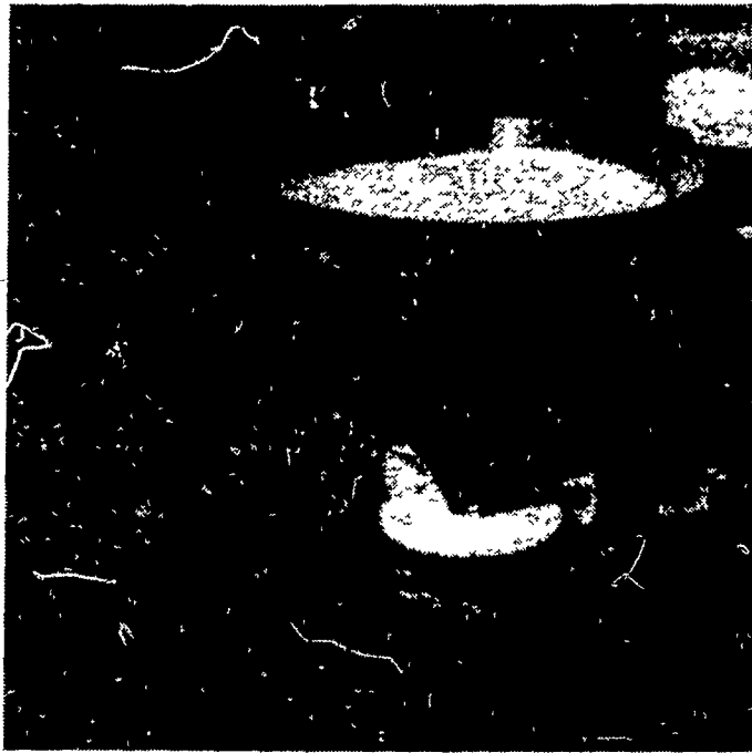
690 lb. (8.5 bu.) capacity single spinner