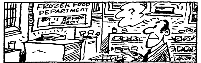
Clarence Birdseye put the first packaged frozen food on sale in Springfield, Mass. on March 6, 1930.

Alfalfa 86 to 112, few loads 115 to 126; Clover 80 to 110; Timothy 85 to 106; Mixed Hay 79 to 122; Grass Hay 83 to 97; Straw 90 to 112, few loads 115 to 120; Soybean Stalks 85 to 100; Hay and Straw mixed 93; Ear Corn 56 to 64.