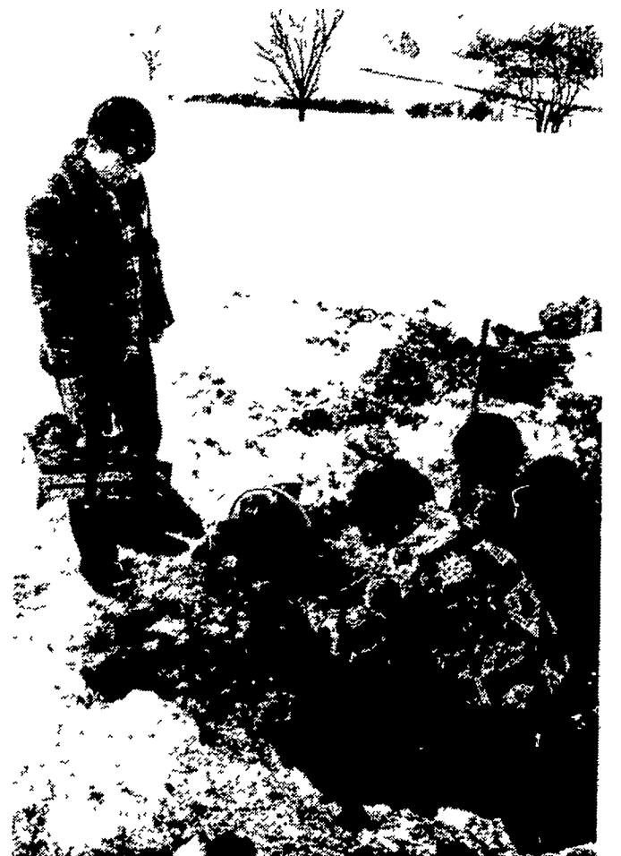
NORLEBCO FFA members dig out pots of Easter flowers which were buried for rooting and storage purposes in November. These will now be marketed through the FFA as a money-making project.