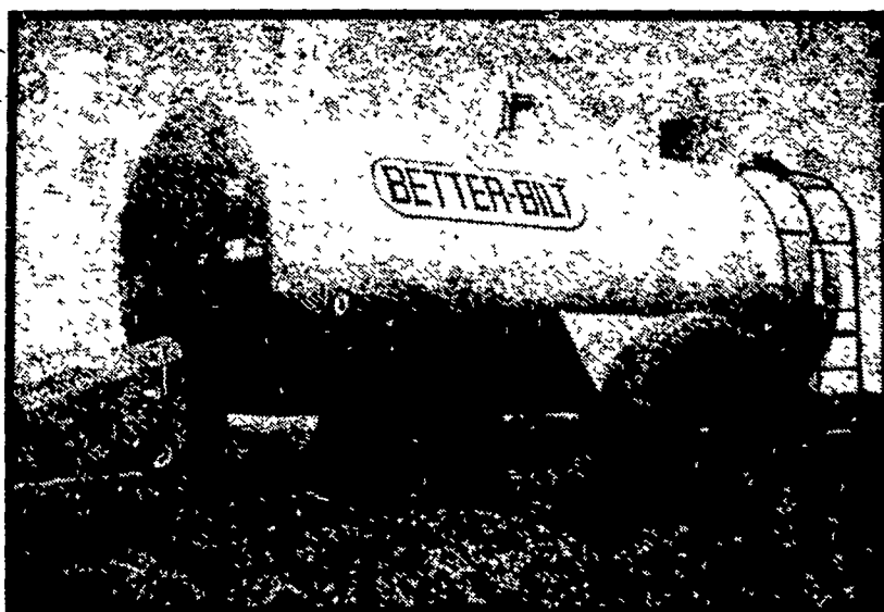
AUGER MATIC SPREADER 1500 - Single Axle

*** SHENKS - YOUR #1 HEADQUARTERS FOR LIQUID MANURE EQUIPMENT