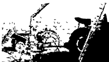
TRANSFER CHOPPER PUMP