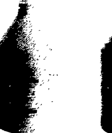
Chlorine Sanitizer (6% Available Chlorine) Gallons only