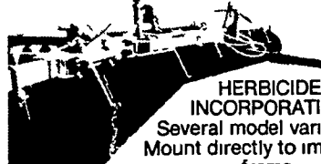
HERBICIDE INCORPORATION Several model variations Mount directly to implement frame