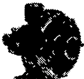
Hydraulic Driven Centrifugal Pumps