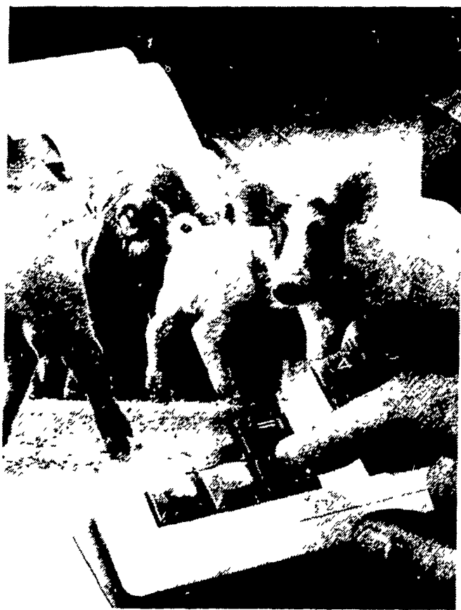
Figure it for yourself.

You get them on feed at half the cost with our pre-starter.