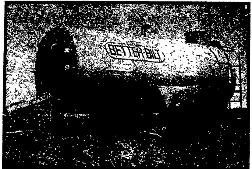
AUGER MATIC SPREADER 1500 - Single Axle