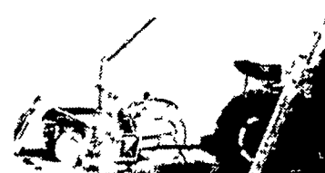
TRANSFER CHOPPER PUMP