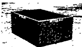
STOCK WATER TANK