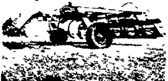
STALK CHOPPER B J Manufacturing Co., Inc. announces the addition of a new implement to their

For complete operating details and specifications on the new Rotaspikes, see your Howard dealer, or write direct to Howard Rotavator Co., Harvard, Ill. 60033.