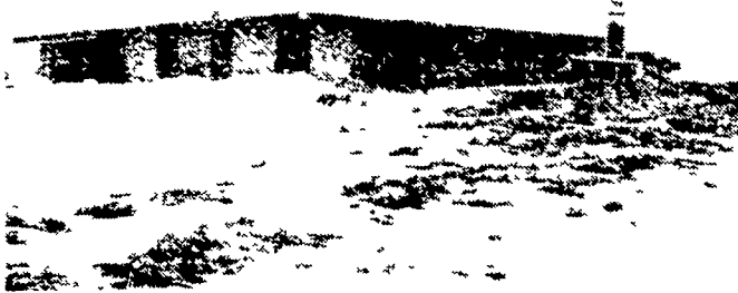
Seen off Rt. 283, the new Messick Farm Equipment offers a complete line of farm services to the area.

Broiler-fryers slaughtered in Pennsylvania under Federal Inspection during the week ending January 4, 1978 totaled 1,470,000.