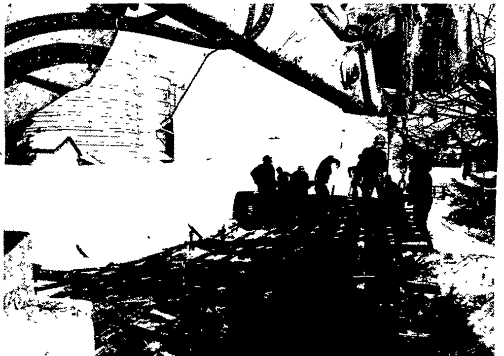
Friends and neighbors gathered at the Smyser Richlawn farm to clear away the remains of a collapsed portion of the dairy barn.

The toll of damages continues as of this weekend.