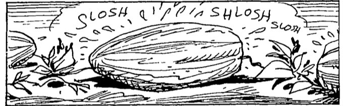
A watermelon is 92 percent water.