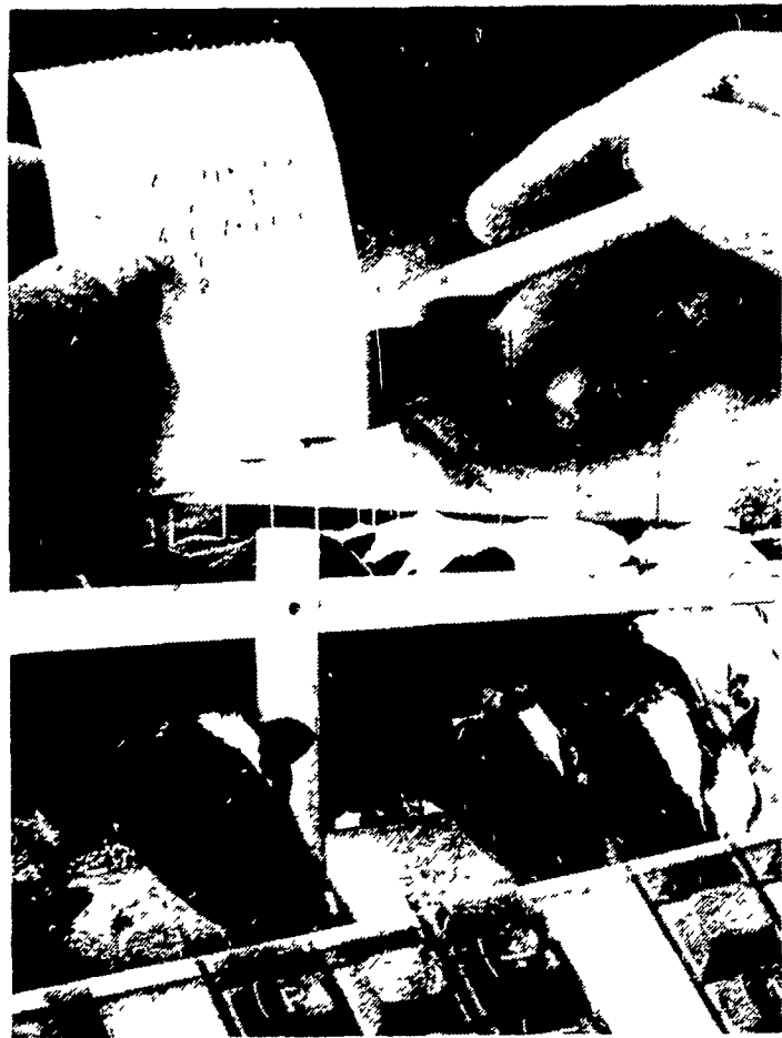
Figure it for yourself.