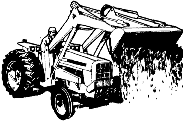
IH 574 TRACTOR WITH IH 2250 LOADER

WE'RE OPEN FOR BUSINESS AT OUR NEW LOCATION RHEEMS EXIT OF RT. 283