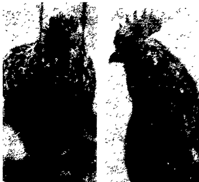
While you were checking out the Farm Show, a lot of other eyes were taking a peek at you. Here are just a few of them.