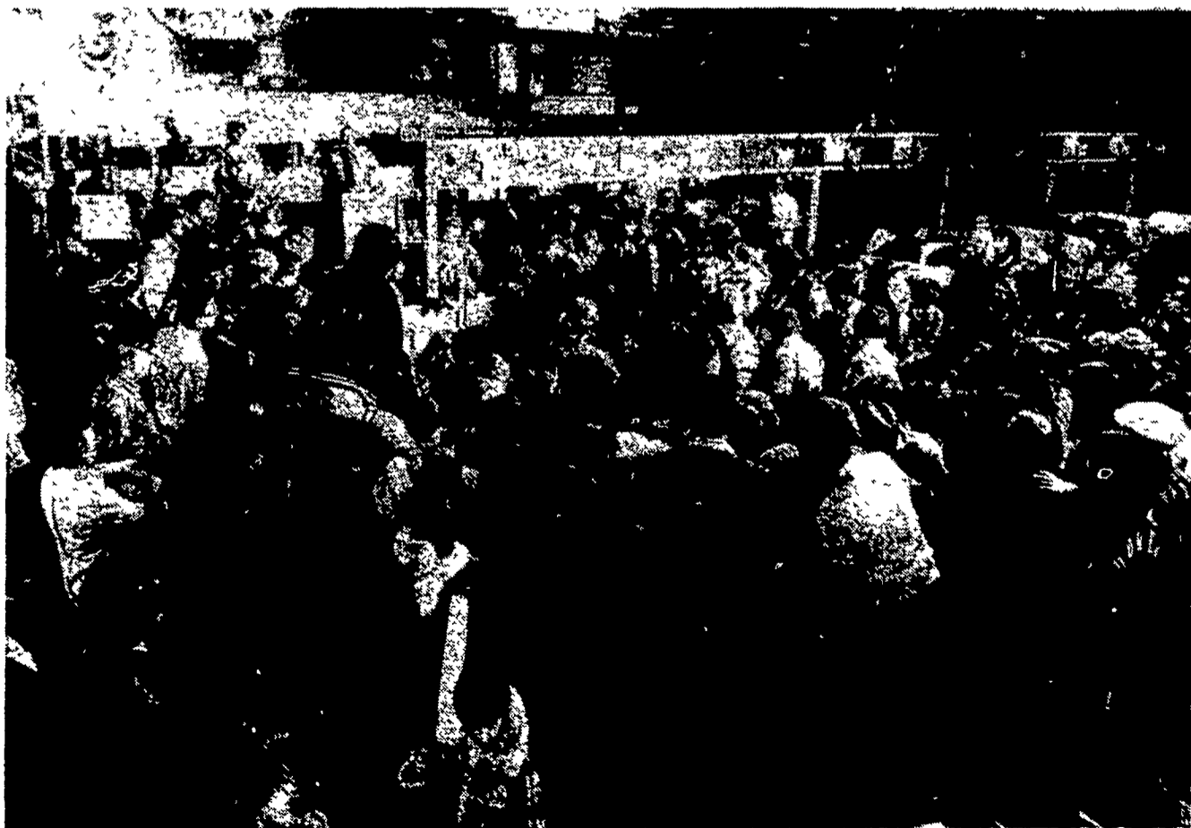
When a cow gets a calf at the Farm Show, it's a main attraction.