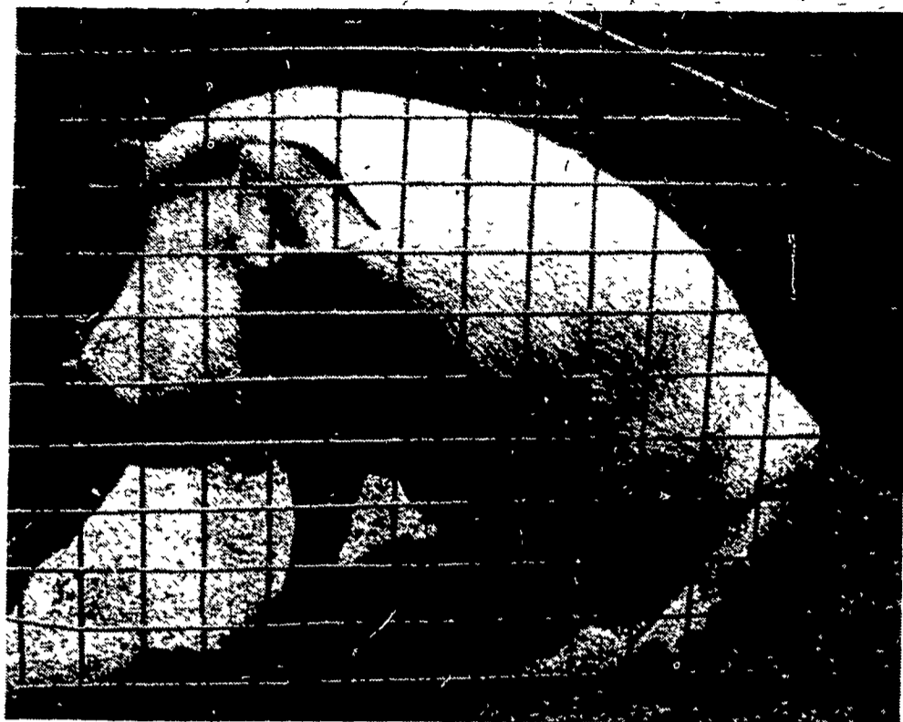
Somehow, the animals at the Farm Show never had any difficulties finding a place to sit down. Visitors weren't as lucky.