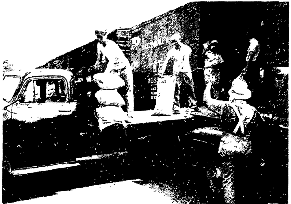
Unloading feed from freight cars was a fact of life in the early years of farmers' cooperatives.

heavy boxcars smacked solidly into the two near the warehouse, shoving them