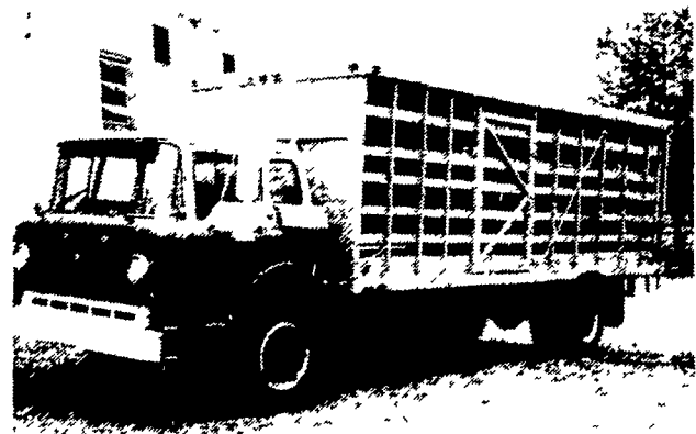
1967 Ford C700 Poultry or Livestock Hauler