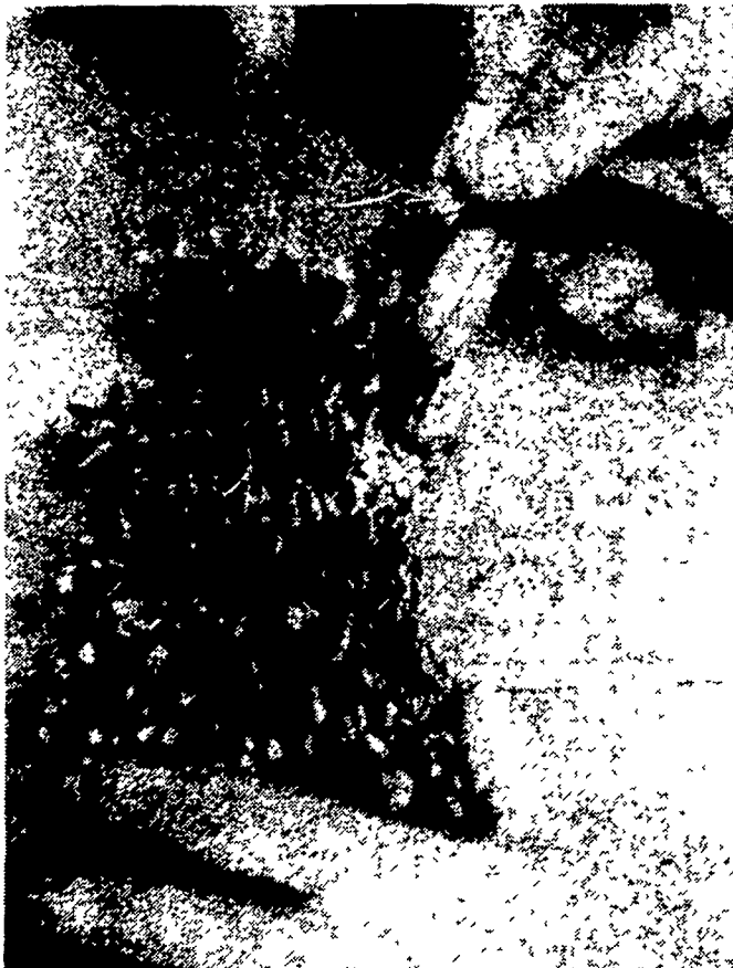
Picture No. 1: To begin making a pine cone wreath, line up the cones and wire them in a row, wrapping the wire around the butt ends.