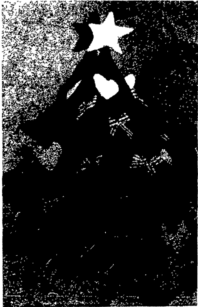
If you have a sewing machine, you can stitch up this colorful stuffed Christmas tree.