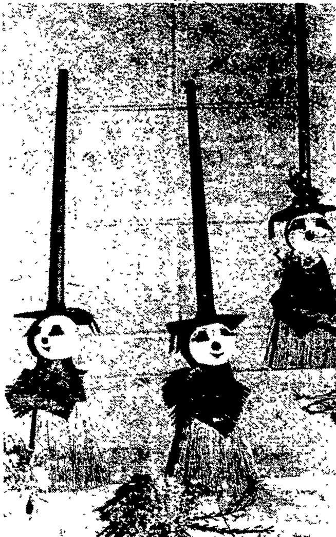
This broom doll will cheerfully welcome all your holiday guests. A versatile decoration, it might grace your fireplace or be surrounded with greens for a door ornament.

Use at the fire place or as a door decoration, mounted on fresh greens.