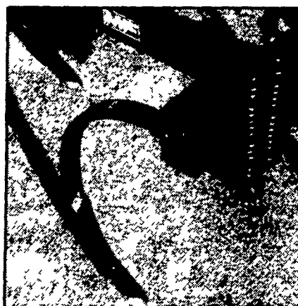
The economical spring cushion shank provides 6 1/2" (165 mm) of flexibility for non-stop operation in rocky or heavy soils