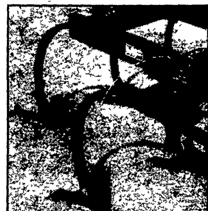
Take a look at the low cost, semi-rigid shank for tillage in rock-free light soils

PERSONALIZED MF FINANCING, PARTS, & SERVICE AVAILABLE