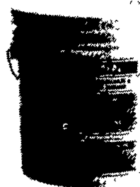
Chlorinated Manual & Bulk Tank Cleaner 25 - 50 - 100 Lb.