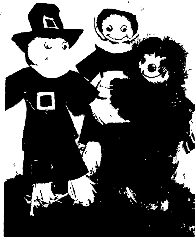
Three corn husk dolls for the season included Mr. and Mrs. Pilgrim and their friend, a happy scarecrow.