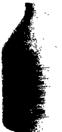
Acid Detergent 1 Gal. & 5 Gal.