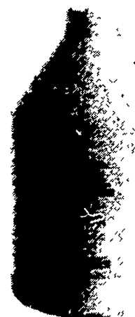
Chlorine Sanitizer (6% Available Chlorine) Gallons only