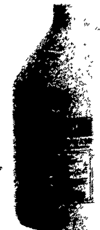
Udder Wash 1 & 5 Gal.

RUBBER CLEANER 5 LB. CONTAINER REMOVES BUTTERFAT AND PROTEIN DEPOSITS