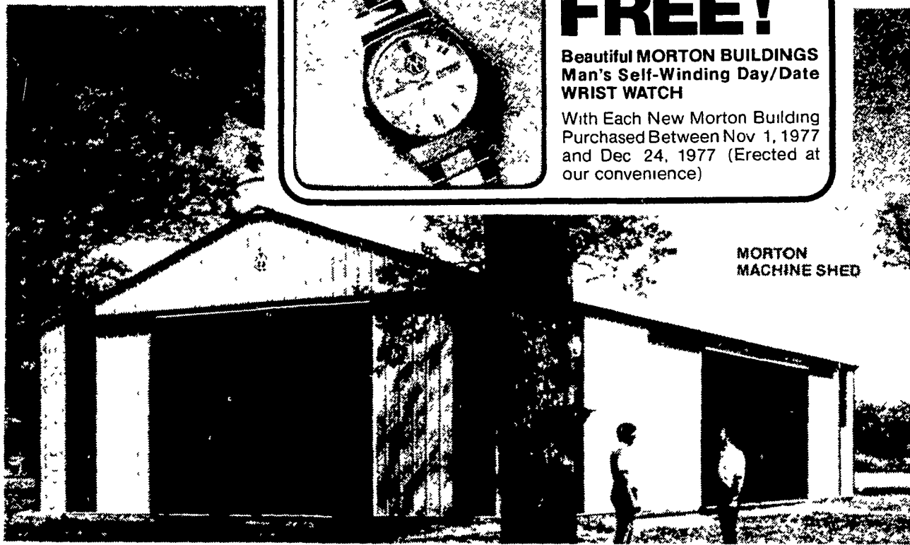
MORTON MACHINE SHED

With Each New Morton Building Purchased Between Nov 1, 1977 and Dec 24, 1977 (Erected at our convenience)