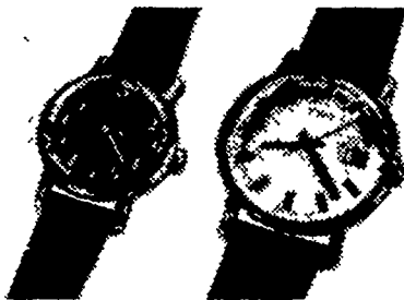
MAN'S OR WOMAN'S TIMEX WATCH