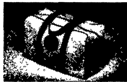
TOWN AND COUNTRY BAG

I'd like more information about your No-Hassle Loan Program. Please contact me at my convenience.