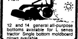
Double Bottom Moldboard Plow

12 and 14 general all-purpose bottoms available for L series tractor Single bottom moldboard plows available