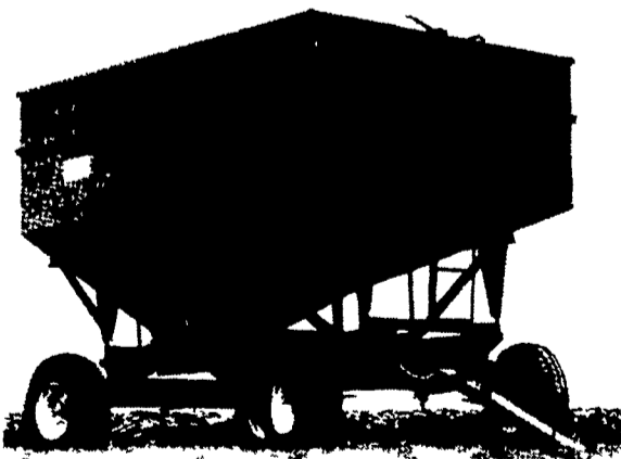
MODEL 230 BIN Without Gears

SPECIAL MCCURDY 41 ft. ELEVATOR $1,170 00