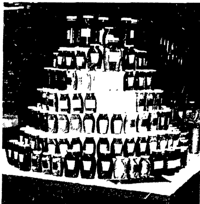
Jars and jars of honey in the Park City shopping mall attracted more shoppers than bees. The honey display was part of the Lancaster County Farmers Association mall promotion.