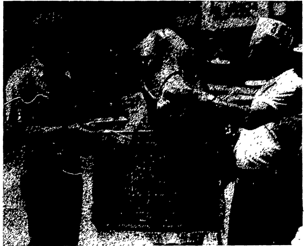
South Penn Farms of New Enterprise exhibited this grand champion at the Guernsey show of the Pennsylvania All-American.

Premier exhibitor for the show was Cloverland Farms Dairy, Inc., of Phoenix, Maryland. Premier sire honors went to "Lyrene May