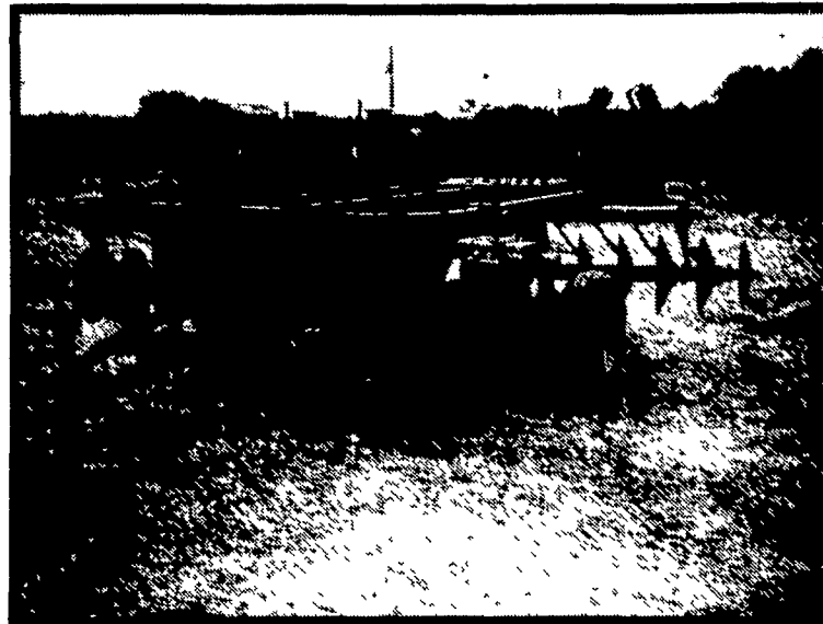
Model 310 12' JD 11" spacing dual wheels dual cylinders

1600 JD chisel 55 IH chisel 490 IH disc 32' 35 IH disc 12' & 14' 20' Brady Field Cultivator IH Graill Drill HPI Tool Bar pictured