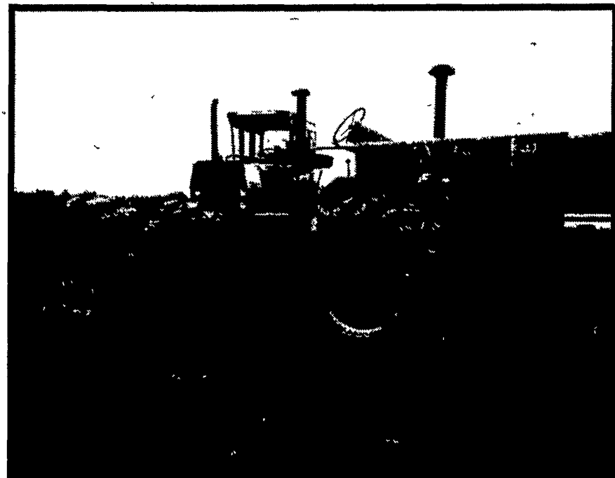
Reconditioned Versatile 145 Cummins Powered/3 pt. Hitch