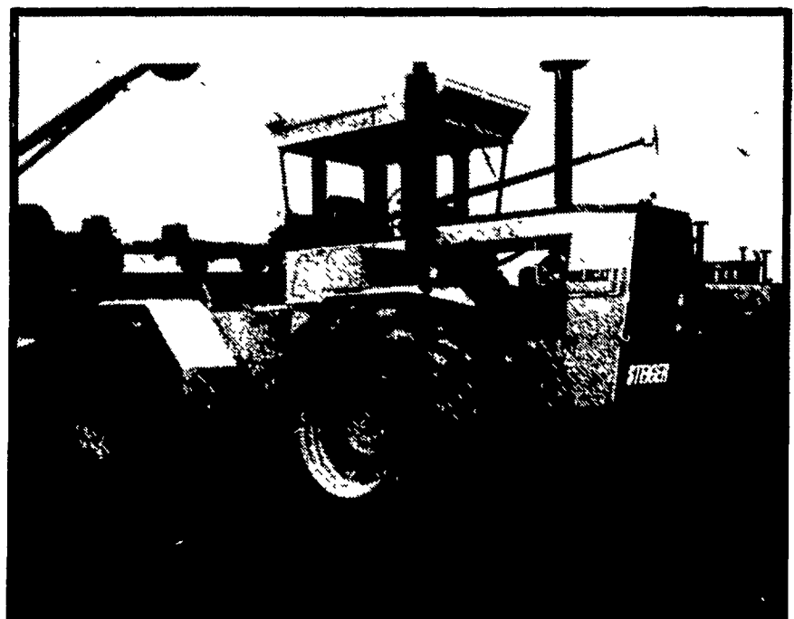
Used Steiger Wildcat III 210 H.P. A/C; AM/FM/Tape; 3 pt.; 580 hrs.