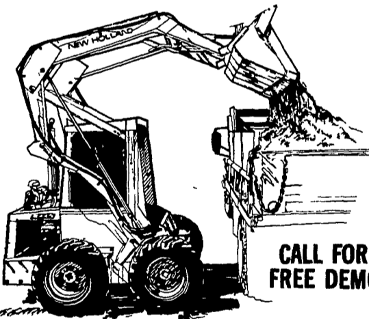
Model L-425 Utility Loader HANDLES MANURE OR DIRT