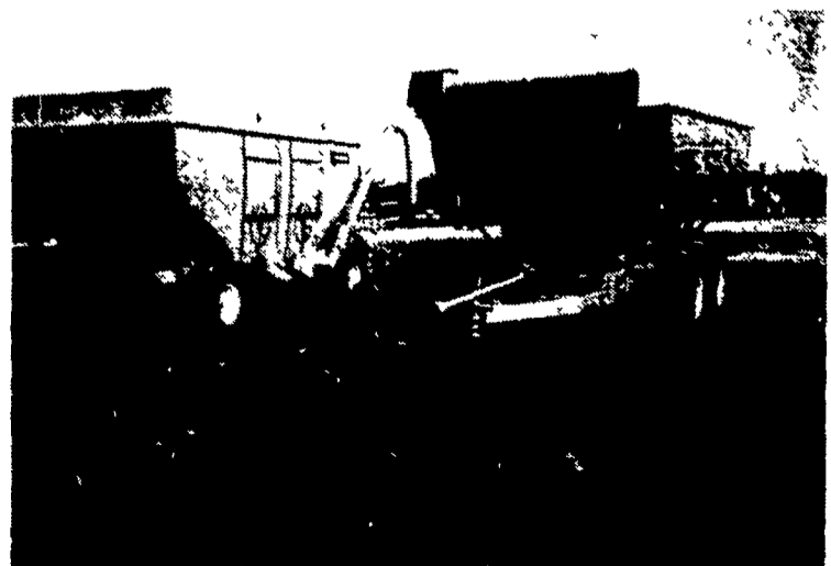
NEW Parker 425 bu. Buggy — 475 bu. Wagon Also in Stock — Parker 600 bu. Wagon

12' Bushhog Mower JD Flail Chopper, like new HPI Tool Bar Model 283 NH Baler IH Grain Drill