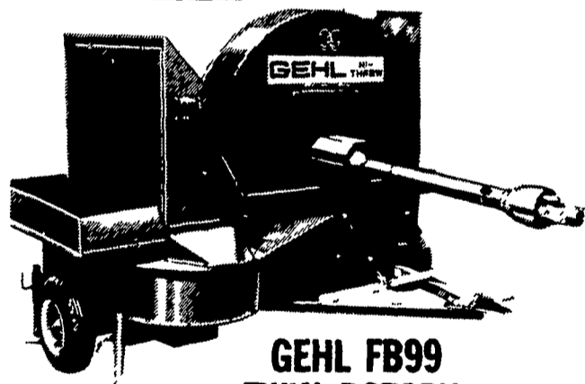
GEHL FB99 TWIN ROTARY