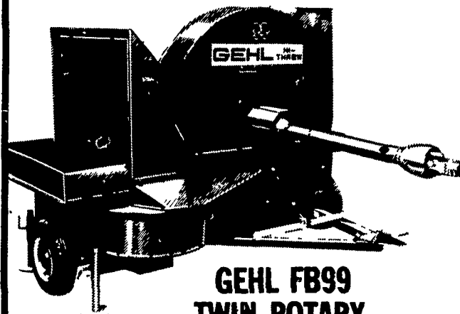
GEHL FB99 TWIN ROTARY Two blowers in one