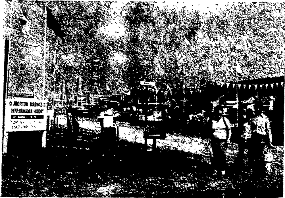
The Ag Progress Days site is a fair sized "town," with equipment and tents lining the streets.